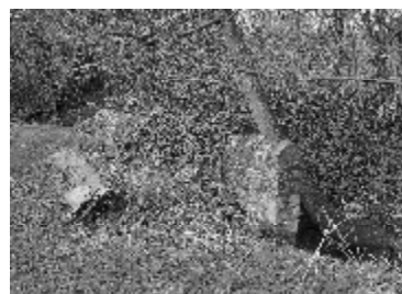
Last month's answer: Boundary Brook